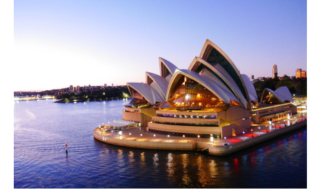
Special is valid until 30th April 2018